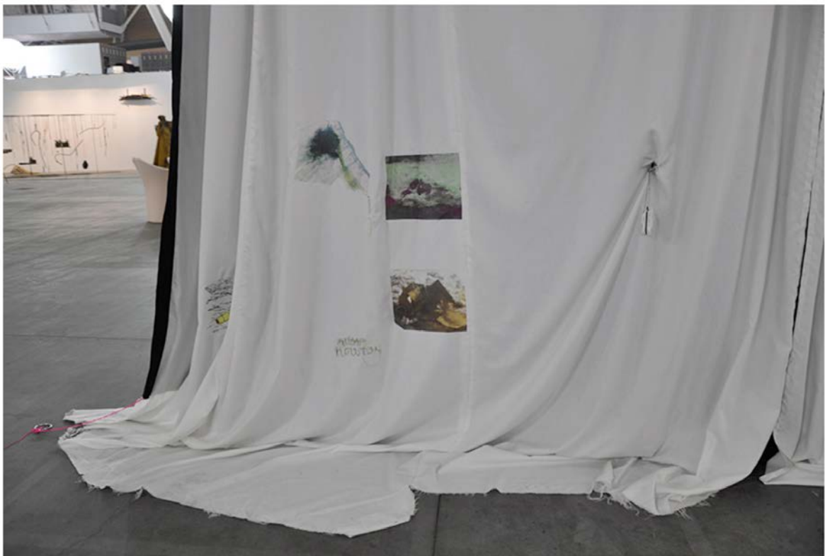
Air de Paris at Artissima 2015