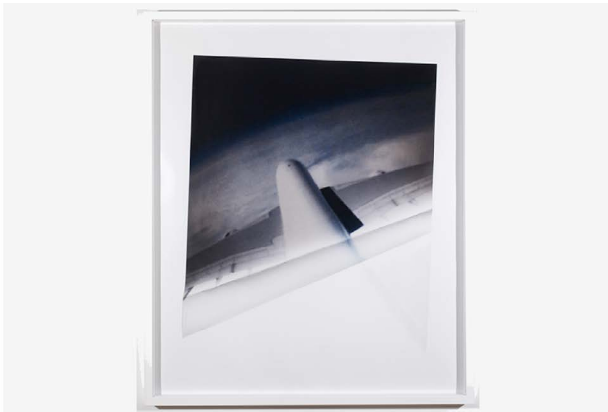
Ingrid Luche – Flying (after TD), 2012-13. Extract from a dyptich, inkjet print on paper, colour pencil, nail varnish, wood frame, 93x78x4,5 cm; 73x53x3 cm.