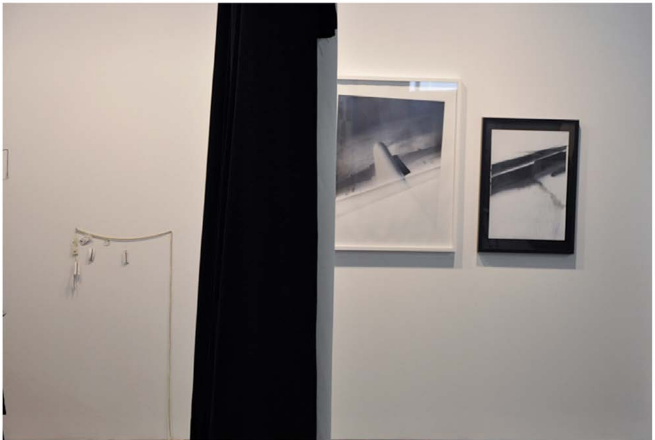
Air de Paris at Artissima 2015