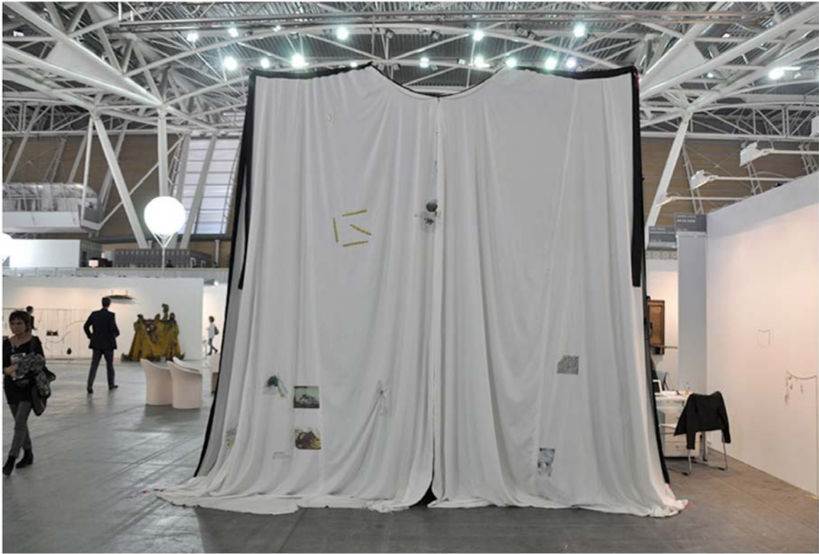
Ingrid Luche at Artissima 2015