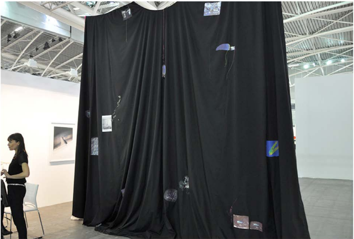
Air de Paris at Artissima 2015